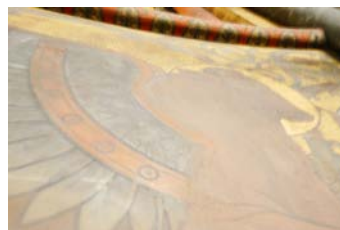
Generalised accumulation of dirt

Buried beneath a layer of dirt and suffering from the effects of damp, this exceptional artistic ensemble is now dulled and difficult to fully appreciate. Specialists will be called in to clean and consolidate the paint and gilt work, helping these paintings to recover their original power and sparkle. The restoration project will also include work to preserve the medieval capitals, as well as the installation of additional, protective panes of glass to shore up the stained glass windows, whose intricate iron frames are testament to the virtuoso skill of the 19th-century glassworkers who crafted them.