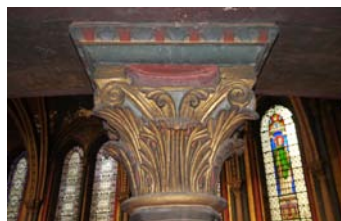
Capital in the triforium and Flandrin's design for Saint Geneviève

Buried beneath a layer of dirt and suffering from the church's excessive humidity, this exceptional artistic ensemble is dulled and difficult to fully appreciate. Specialists will be called in to clean and consolidate the paint and gilt work, helping these paintings to recover their original power and sparkle. This programme of restoration will also include work to restore the medieval column capitals, as well as the installation of additional, protective panes of glass to shore up the stained glass windows, whose intricate iron frames are testament to the virtuoso skill of the 19th-century glassworkers who crafted them.