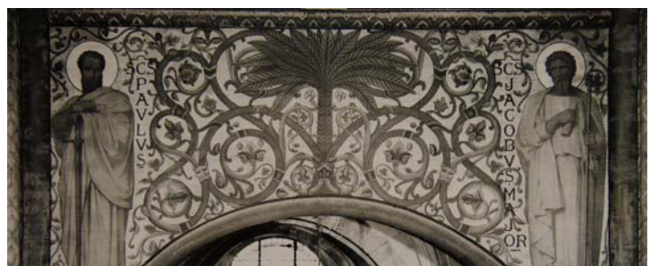
Detail of the principal motif

Now coated in a layer of dirt and damaged by the church's excessive humidity, this exceptional artistic ensemble is dulled and difficult to fully appreciate. Specialists will be called in to clean and consolidate the paint and gilt work, helping these paintings to recover their original power and sparkle. The restoration campaign will also include work to preserve the medieval capitals, as well as the installation of new support panes to secure the stained glass windows.